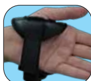
Tighten by pulling the velcro