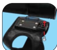
Fix the glove on the light with the supplied screw